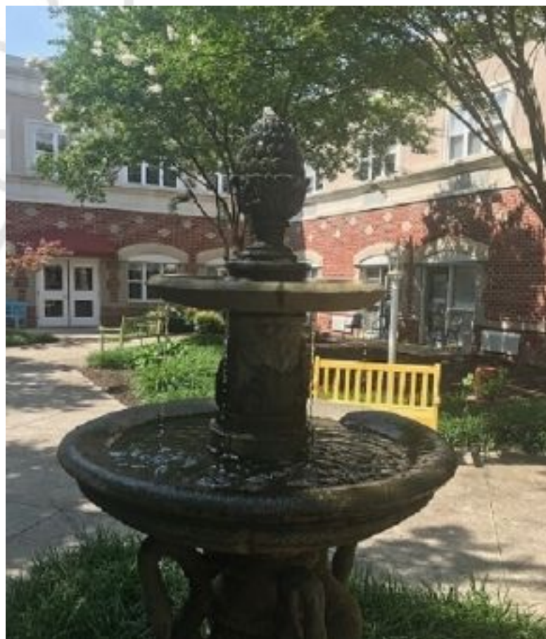
NEW FOUNTAIN FOR IRONBRIDGE